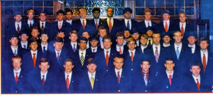
Forty-four of the 47 new members welcomed into the chapter. This year's successful recruitment is attributed to the alumni and friends who donated their time and provided member referrals.