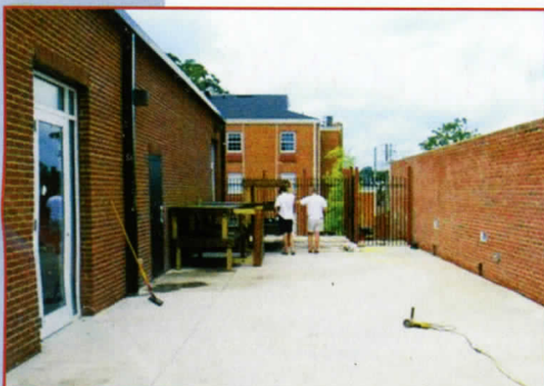
The newly constructed back porch at the chapter house was completed in August.

House Corporation President mboardman@boardmancarr.com (205) 678-8000