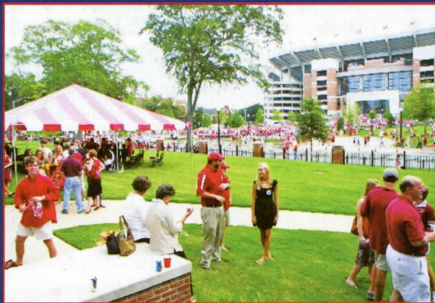
Alumni and friends gather at a Delta Theta tailgate. The active chapter invites you to join in on the socializing and refreshments and to cheer on the Crimson Tide.